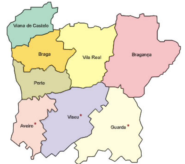
Image: Example of the scope of the ARS- Norte